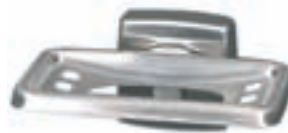
Tumbler Toothbrush Holder

S-4920 4 1/4" x 3"; 2 1/4" hole for tumbler, 6 toothbrush holes