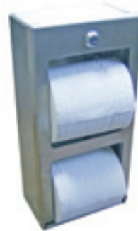
Double Roll Toilet Tissue Dispenser (Surface Mount)

C-1040-SS 22 ga. stainless steel, holds two 5 1/4" dia. rolls, pivoting front cover equipped with tumbler lock. 4 13/16" x 13 1/4" x 4"