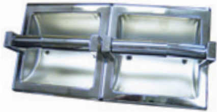
S-2659 Recessed Double Toilet Tissue Dispenser

Overall Size: 12-1/2" x 6-1/4" " Rough Wall Opening: 11-1/2" x 5 1/4" x 2"