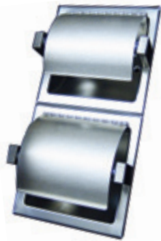
S-2661-01 Vertical Hinged Hood Recessed Double Toilet Tissue Dispenser

Overall Size: 6-1/4" x 12-1/2" Rough Wall Opening: 5 1/4" x 11-1/2" x 2"