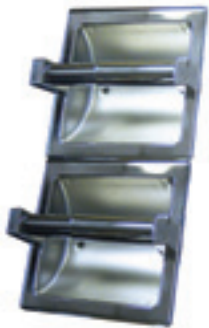
S-2661 Vertical Recessed Double Toilet Tissue Dispenser

Overall Size: 6-1/4" x 12-1/2" Rough Wall Opening: 5 1/4" x 11-1/2" x 2"