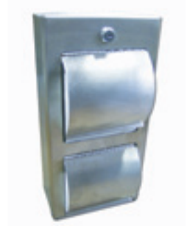
Double Roll Toilet Tissue Dispenser w/ Hinged Hoods (Surface Mount)

C-1040-01-SS 22 ga. stainless steel, holds two 5 1/4" dia. rolls, pivoting frontcover equipped with tumbler lock. 4 13/16" x 13 1/4" x 4"