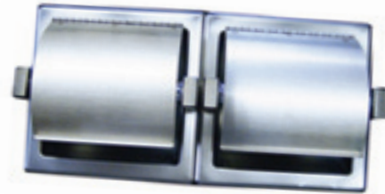
S-2659-01 Hinged Hood Recessed Double Toilet Tissue Dispenser

Overall Size: 12-1/2" x 6-1/4" " Rough Wall Opening: 11-1/2" x 5 1/4" x 2"