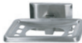
Tumbler Toothbrush Holder

S-4520 4-1/4" x 3"; 2-1/4" hole for tumbler, 6 toothbrush holes