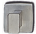
Single Hook Holder

S-4931 Projects 2" S-4933 Projects 4 1/4"