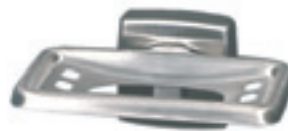
Tumbler Toothbrush Holder

S-4920 4 1/4" x 3"; 2 1/4" hole for tumbler, 6 toothbrush holes